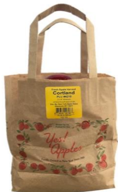
Tote Sticker Example (with font size)